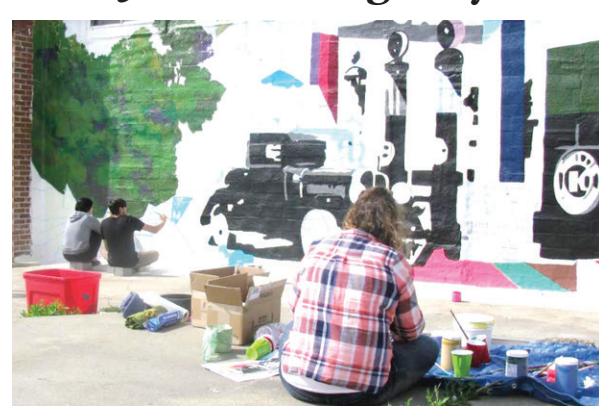
Pictured: Volunteers work on a Jefferson Highway-themed mural of a vintage car and gas station scene at the corner of Chestnut and Main Streets in 2017.

Once a bustling thoroughfare, now a nostalgic journey, the Jefferson Highway invites exploration with a visit to Lamoni where a piece of this historic artery and two commemorative murals await. The Highway offers a glimpse into a bygone era. Crisscrossed by modern interstates that prioritize speed over scenery, the Jefferson Highway has transitioned into a charming route for those seeking a more relaxed and historic driving experience. Originally dedicated in 1916, the Jefferson Highway wasn't the typical highway of today. While "hard surface" meant little more than avoiding mud bogs, this innovative north-south route stretched from Winnipeg, Canada, all the way down to New Orleans, Louisiana, making it the nation's first long-distance international highway. Nicknamed "The Pine to Palms Highway" (or "Palms to Pines" depending on your starting point), the Jefferson Highway connected travelers with diverse landscapes, from the towering pines of the north to the sun-kissed palms of the south. "While Jefferson Highway may no longer be the fastest route from one location to another," Mayor Douglas Foster said, "it continues to link small towns and large cities along its 2300 miles from Winnipeg to New Orleans in an era when connections are more important than ever." Traveling the Jefferson Highway today offers a unique opportunity to experience a bygone era of auto travel where travelers can trade the high-speed lanes of modern interstates for